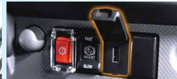
Brand New Feature - USB Charging Port