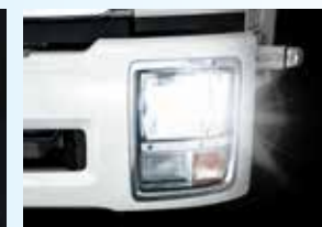
LED Headlight to provide better visibility