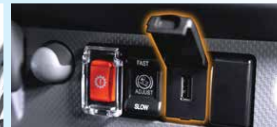
Brand New Feature - USB Charging Port