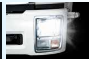
LED Headlight to provide better visibility