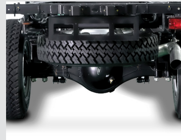
Bigger axle capacity