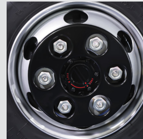
Front free wheel hubs