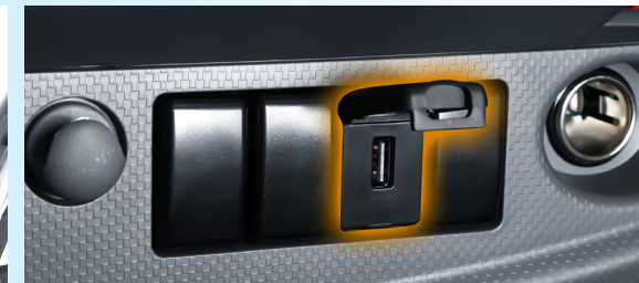
Brand New Feature - USB Charging Port