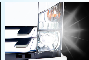
LED Headlight to provide better visibility